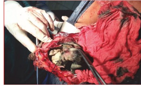
FIGURE 3: Image of perforated colon and abdominal swab in its lumen.

Migration occurs followed by an inflammatory necrosis of the intestinal wall and/or an excessive pressure exerted