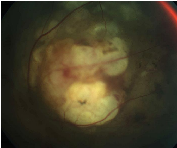
Fig. 1. Amelanotic choroidal melanoma in the right eye before treatment.