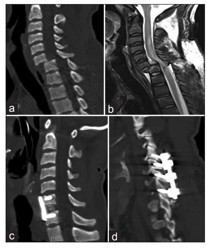
Figure 2: (a) Noncontrast computed tomography (NCCT) of cervical spine with C6–7 listhesis and bilateral locked facets; (b) Magnetic resonance imaging of cervical spine showing severe cord compression at C6–7 level with cord edema from CVJ to D1. (c and d) Postoperative NCCT scan showing good lordosis of cervical spine achieved with C6–7 discectomy, iliac crest graft with plating and posterior fixation

At last follow-up 22 (63%, of the 35 patients with long follow-up patients) had improvement in ASIA grade in both groups, 9 (69%, out of 13 followed up) patients in Group A as compared to 13 (59%, out of 22 followed up) patients in Group B ( P - 0.72). More than 2 ASIA grade improvement was noted in 4 (31%) patients in Group A and in 7 (32%) patients in Group B [Table 5]. On multivariate logistic regression after removing significant baseline factors, difference in improvement in ASIA scale between the two groups were not significant ( P - 0.54, odds ratio: 1.58; confidence interval: 0.36–6.86).The factors like administration of methylprednisolone (2 patients [9%] were