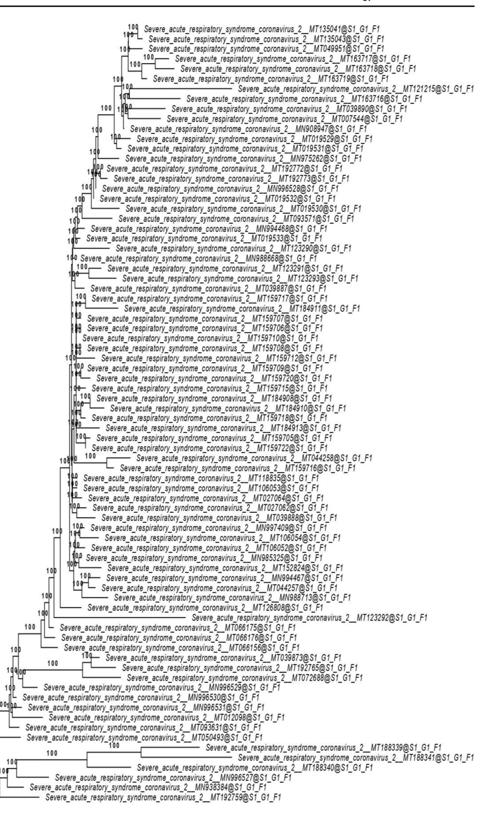
Fig. 3 Phylogenomic tree inferred using the formula D6 (GBDP_Trimming_D6_ FASTME). The numbers above branches are bootstrap support values from 100 replications