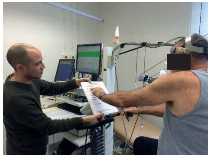
FIGURE 2 Cardiopulmonary exercise testing in the lung function laboratory at UZ Gasthuisberg (Leuven, Belgium).

I was fortunate that our completed research was successfully published in the European Respiratory Journal [18] and stimulated much discussion within the field of pulmonary rehabilitation. I subsequently leveraged upon these fellowship outcomes to successfully acquire further postdoctoral funding applications upon my return to Australia. I would simply not have been competitive without international fellowship experience on my CV. A significant personal achievement to have arisen from my ERS fellowship experience was the confidence to establish my own research laboratory focussing on the mentorship of clinician-researchers interested in respiratory medicine and rehabilitation (ResPTlab, www.resptlab.com ).