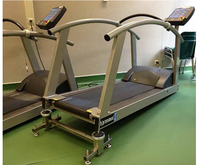
FIGURE 1 Downhill treadmill walking equipment.

In terms of outcomes, I feel the hard work of my fellowship rewarded me with many positive experiences. I developed many new, enduring international professional connections and friendships. I obtained closer engagement with the ERS Groups and Assemblies, and the European Lung Foundation than previously possible. I gained exposure to world-leading international practice and research perspectives. I developed leadership and mentorship skills to supervise clinical research students. I also developed new clinical skills in areas such as cardiopulmonary exercise testing (figure 2), physical activity measurement and analysis, electromagnetic muscle stimulation, and muscle biopsy collection and analysis.