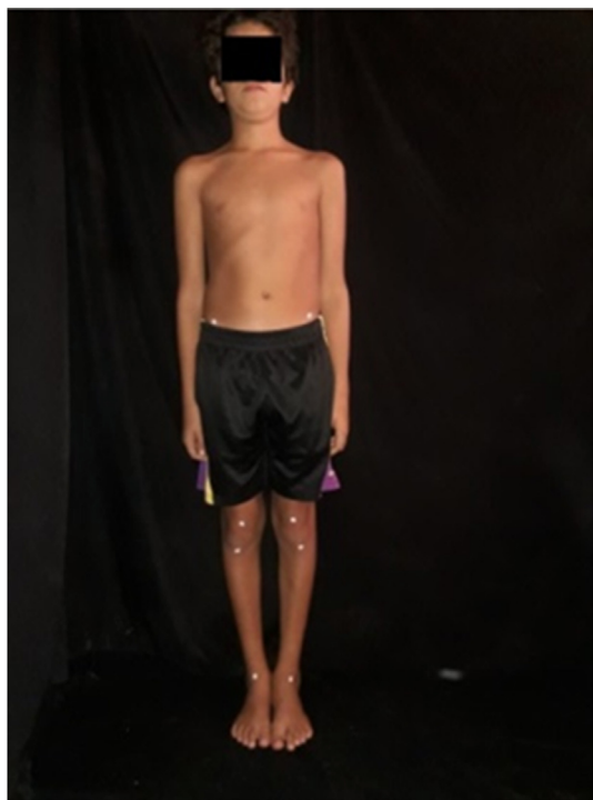
Figure 2: The imaging process.