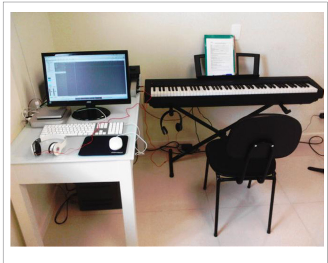
FIGURE 1 | Laboratory.

The sound and musical tasks were divided in Task 1 - spontaneous time was based on a spontaneous time test by Mira Stambak (45) and adopted to be performed and registered on the computer. The participant was instructed to tap a regular freeform beat. The beat played by the participant was recorded on the computer and the analysis considered the performance of the three groups according to the dispersion from median 10, over 10 s (>10 s - Slow) and below 10 s (<10 s - Fast) to perform 21 beats. Task 2 - time estimation with simple sounds: twenty pairs of simple sound with different durations and separated by short intervals with silence. The instructor provided the participant with the rules of the task and then played the prerecorded instructions that contained three pairs of stimuli for training and adaptation. The participant then heard each pair of sounds and compared the durations by responding verbally if the stimuli were the same or different. Stimuli contained periods between 500 ms and 1 s, with the differences in duration varying from 0 ms (no difference), 20 ms (2%), 30 ms (3%), 50 ms (5%), 70 ms (7%), 100 ms (10%), 150 ms (15%), 200 ms (20%),