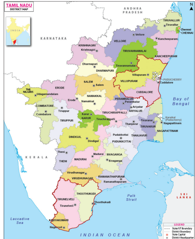
Figure 1: Selected districts (Tirunelveli, Tuticorin, and Kanniyakumari of South India) ICDS centers that were screened under “Lavelle Paediatric Eye Care Project”. ICDS = Integrated Child Development Services