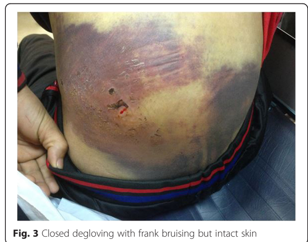
Fig. 3 Closed degloving with frank bruising but intact skin