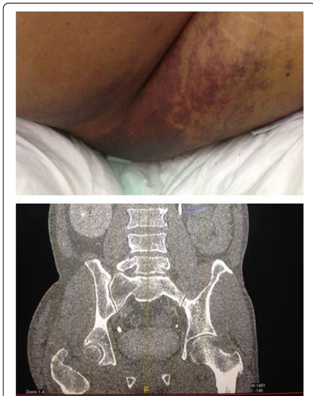
Fig. 4 Morel Lavallee lesion (common site) and Coronal CT view of the lesion

Management of closed DSTI is more challenging due to lack of evidence-based guidelines, these injuries are either treated by non-operative therapy or percutaneous and operative techniques. In our study, majority of patients with closed DSTI (78 %) underwent conservative treatment. Hak et al [9] performed open debridement of the Morel-Lavallée lesion with the incision placed close to the middle of the degloved area with thorough exploration for possible loculations. However, due to high incidence of complications such as re-accumulation of hematoma, wound breakdown and infection, the authors left the wound open post debridement [9]. A retrospective study by Nickerson et al [20] reported various treatment options for Morel-Lavallée lesions or closed DSTI such as compression wraps or observation, percutaneous aspiration or operative management with incision/drainage and formal debridement of skin and soft tissues. The authors observed that aspiration of more than 50 mL of fluid from Morel-Lavallée lesions was more frequent among lesions that recurred (83 %) as compared to those that resolved (33 %). Therefore, it has been recommended that aspiration of more than 50 mL of fluid from a Morel-Lavallée lesion should prompt operative