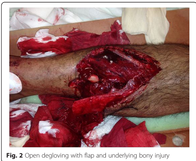
Fig. 2 Open degloving with flap and underlying bony injury