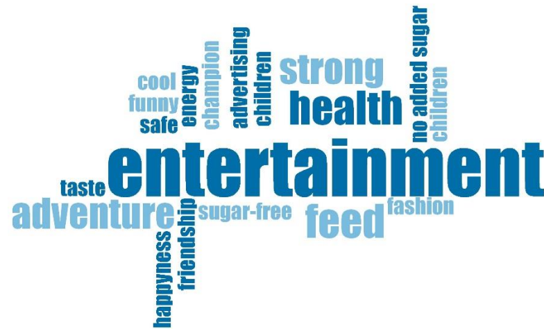
Figure 2. Words combinations found in the ads.