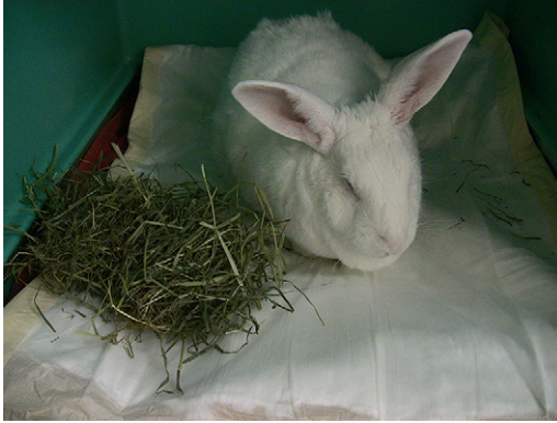
Fig. 3. Ill rabbit hospitalized on absorbent human hospital “underpads.” Pads help prevent urine accumulation and scalding.

Analgesia for hospice patients should emphasize optimal pain control, with lesser regard for untoward systemic effects.