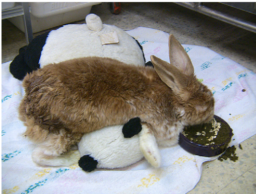
Fig. 2. Older rabbit with a history of severe acquired dental disease, retrobulbar abscess, and enucleation of the right eye. The rabbit survived with good quality of life for several years on Oxbow Critical Care and soaked pellets. Worsening splay leg of the thoracic limbs resulted in decreased mobility. The owner used towels and a stuffed animal to support the pet during brief hospice care at home before ultimately choosing euthanasia.

Supplemental feeding is often beneficial. Critical Care can be offered in a dish or via syringe feeding. The manufacturer provides detailed instructions for product use.