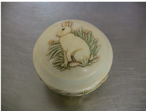
Fig. 4. Decorative urn designed by a pet cremation company for a rabbit.

Humane, stress-free euthanasia requires careful planning and implementation, especially when the owners wish to be present. The American Veterinary Medical Association Guidelines on Euthanasia for rabbits suggest the following: barbiturates, CO 2 , CO, or potassium chloride in conjunction with general anesthesia. Other listed acceptable techniques such as cervical dislocation are unacceptable to most veterinary staff and owners. 27 The author prefers the following technique, especially when owners wish to be present: induction with medetomidine at 50 µg/kg, and ketamine, 30 mg/kg administered intramuscularly. Owners are encouraged to hold their pet