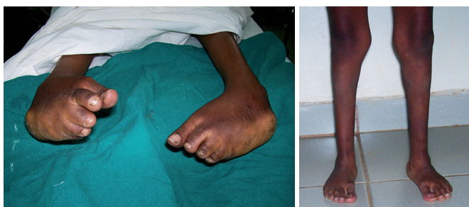
Figure 3. 4-year-old boy before treatment. After treatment.