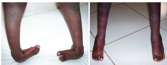
Figure 4. 8-year-old boy before treatment. After treatment.

ual equinus was treated. All the children who had open procedures were 5 years old or more. Postoperatively, a long leg cast was applied and kept on for 4 weeks. The 3 children who had ATL and posterior capsulotomy were the 3 oldest: at 8, 9, and 10 years of age. There were no major complications during cast application or during the limited surgical interventions. No extensive soft tissue releases or corrective bony procedures were required to obtain correction. The equinus was corrected to above neutral in dorsiflexion. All the children obtained a corrected, plantigrade, flexible, pain free-foot. The latter was based on clinical judgment, and no detailed pain scoring was done. They could all walk and run. A significant improvement in the cosmetic appearance was observed in all children. They could perform their normal daily activities and were all able to wear normal shoes for the first time in their lives.