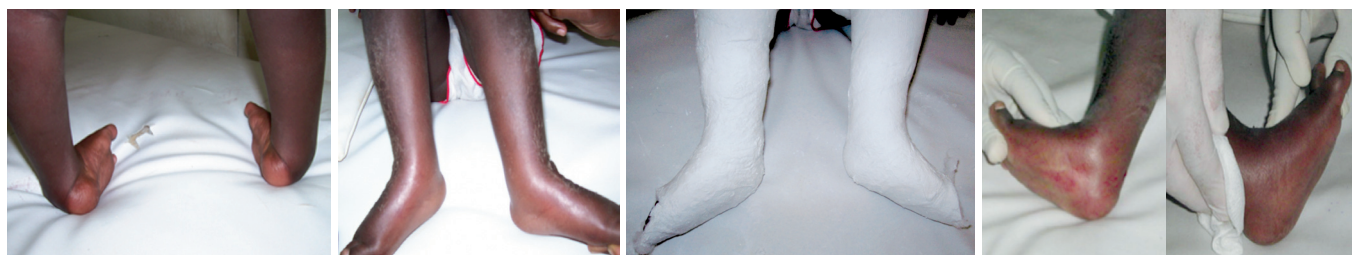
Figure 2. 3-year-old boy before treatment. After 5 casts.

The midfoot was corrected to Pirani 0 in all feet after the casts. The correction was obtained with an average of 8 (6–10) casts, the number of casts increasing with age. In patients up to the age of 4 years, hyperabduction up to 60–70 degrees was achieved in the final cast. In the older children, abduction was only possible up to 30–40 degrees, but this did not appear to reduce the final walking ability. Figure 1 shows how the resid-