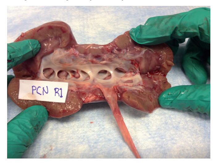
Figure 1 - Representative image after retrograde dye delivery with ureteral catheter.