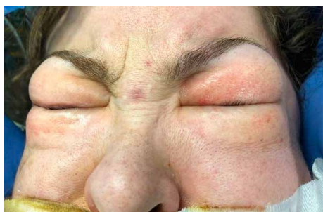
FIGURE 1: Massive subcutaneous emphysema with swelling of the face and periorbital area. The emphysema was caused by laparoscopic robotic myectomy.