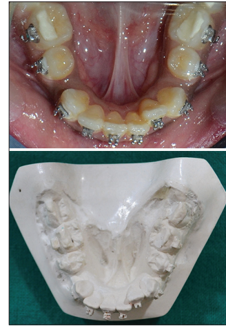
Figure 2: Patient photograph and dental cast 1 month after the placement of the archwire