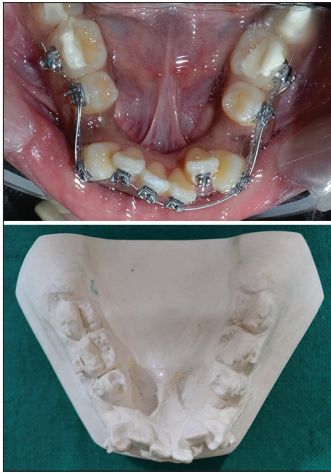
Figure 1: Patient photograph and dental cast immediately after the placement of the archwire