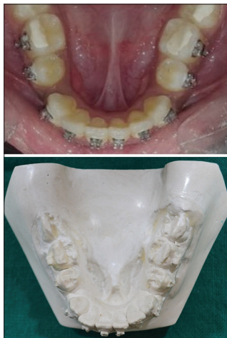
Figure 3: Patient photograph and dental cast 2 months after the placement of the archwire

Pain perception of the patients was recorded after 24 hours and 1 week after the placement of the archwire on a visual analog scale.