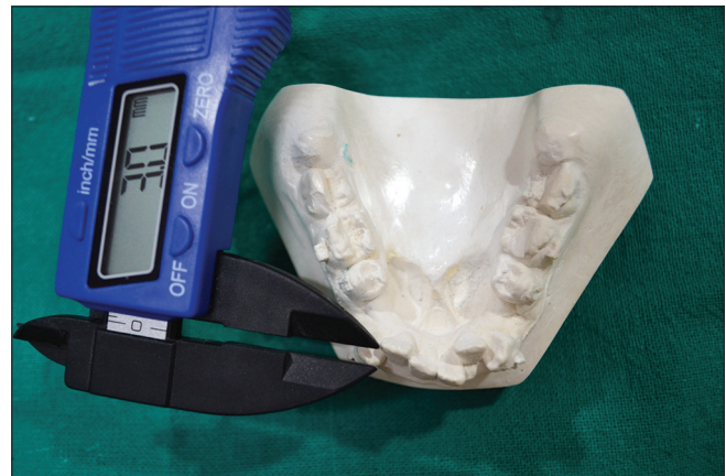
Figure 4: Measuring the irregularity index using Vernier caliper

The maximum linear length between cusps and root apex was measured using axial multiplanar