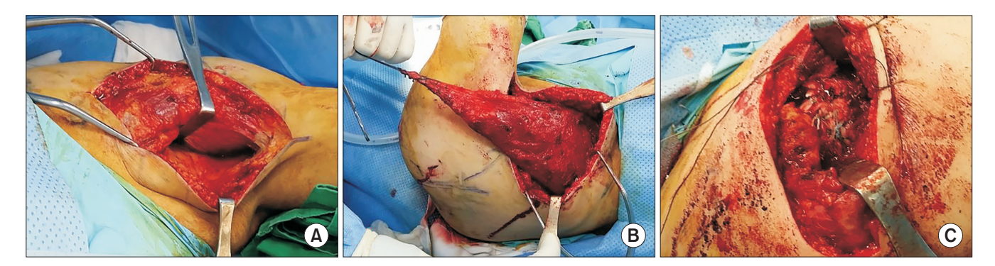
Fig. 2. Surgical procedure. (A, B) Curvilinear longitudinal incision (15 cm) was performed from the tip of the scapular and axillary fold. After fascial incision, thin tendinous portion of the LD tendon was released and detached from the humeral bone. (C) On the anterior greater tuberosity, two anchors were inserted, after which the suture bridge rotator cuff repair was performed.

ASES: American Shoulder and Elbow Surgeons, UCLA: University of California, Los Angeles, SST: Simple Shoulder Test.