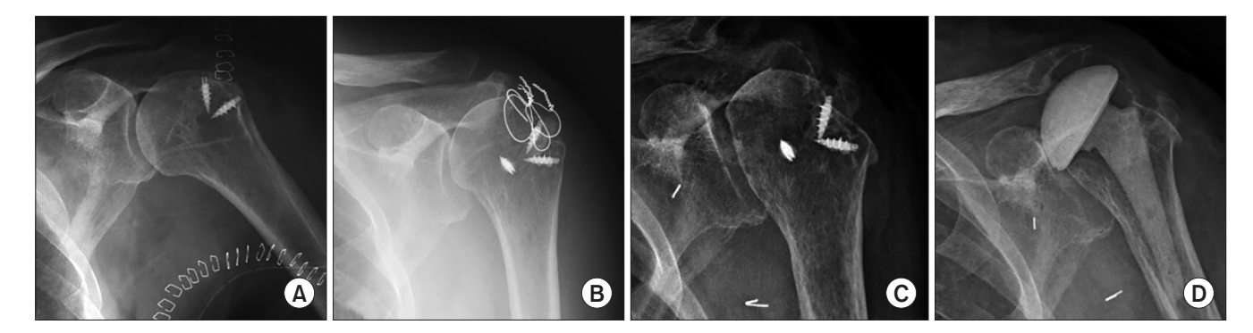
Fig. 5. (A) After latissimus dorsi tendon transfer, at postoperative 10 years. (B, C) Complications of the latissimus dorsi tendon transfer are observed. Development of progressive osteoarthritis. (D) Insertion of PROSTALAC.