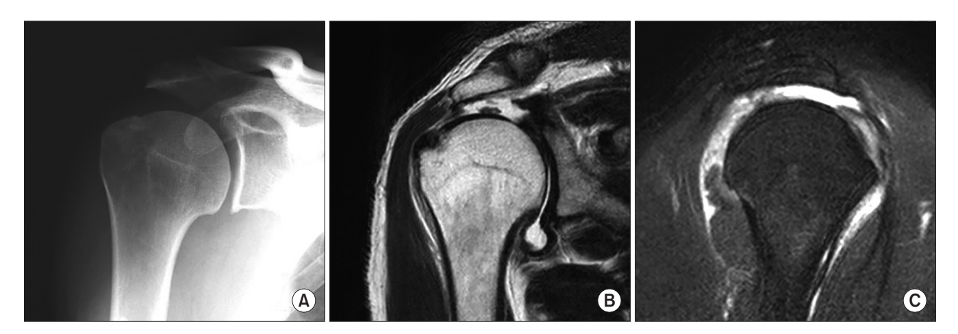
Fig. 1. A 59-year-old male patient suffered from chronic shoulder pain due to a slip down injury. (A) Preoperative X-ray shows no definite abnormality. (B, C) Coronal and sagittal magnetic resonance imaging view show massive retracted rotator cuff tear without osteoarthritis.

Values are presented as number only, mean (range), or mean \pm standard deviation (range).