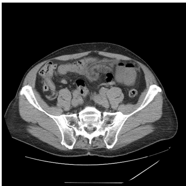
Fig. 1. CT of the abdomen in a 78-year-old man with increasing abdominal pain over approximately 6 h. The CT scan shows whirling of the mid-abdominal mesentery with edematous changes of the fat and congestive prominence of mesenteric vessels amongst small bowel loops at this level. Early small bowel obstruction was seen with transition point in the left lower abdomen.