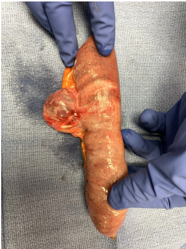
Fig. 3. Resected specimen of the jejunal diverticulum. The diverticulum was removed with approximately 15 cm of bowel on each side of the diverticulum.

mesentery which indicates profound compromise of the bowel and a need for immediate surgical intervention [19]. A delay in performing the exploratory laparotomy would have been catastrophic. Mechanical derotation of the bowel back to its normal position allowed it to recover from its venous compromise. An extended delay in proceeding to laparotomy would have resulted in bowel infarction and loss of a major portion of the jejunum and at least some of the ileum.