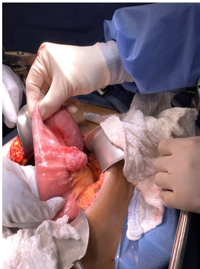
Fig. 2. Jejunal diverticulum seen at the time of exploratory laparotomy prior to resection. The outpouching of the bowel wall occurs at its mesenteric border.

The patient recovered from surgery without incident. He was maintained on nasogastric suctioning for 72 h initially with a large