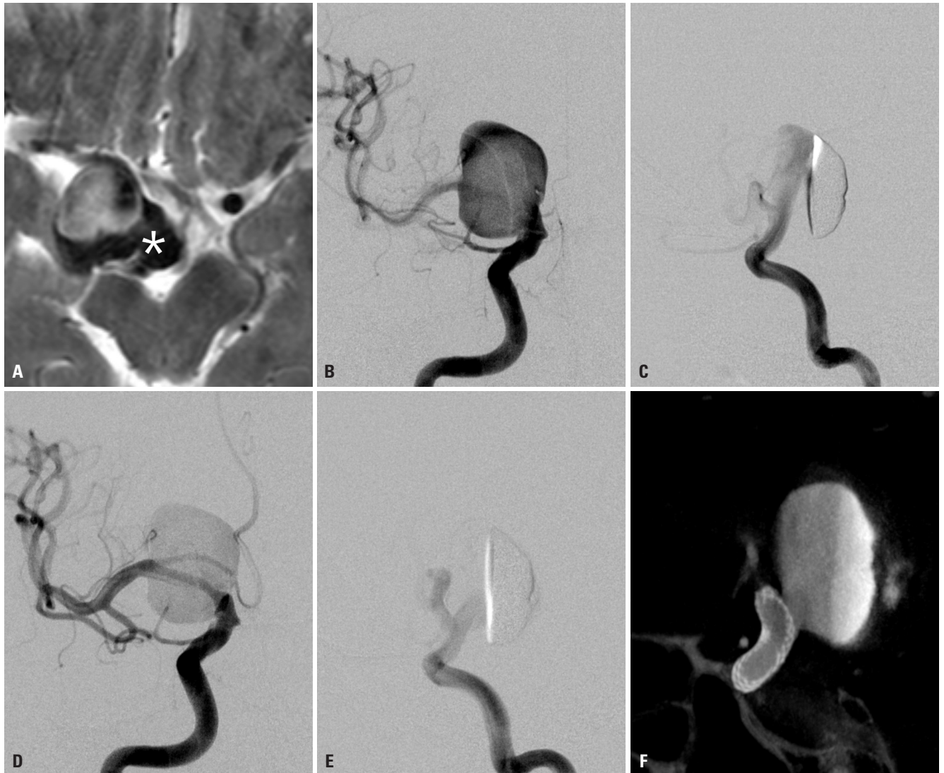
Fig. 1. Images of the partially thrombosed aneurysm pre- and post-stenting. (A) Initial T2-weighted magnetic resonance imaging shows a partially thrombosed (asterisk) giant aneurysm in the cavernous segment of the right internal carotid artery. (B and C) Preoperative digital subtraction angiography reveals a giant aneurysm with the inflow jet axis oriented posterosuperiorly toward the aneurysm dome on the sagittal plane. (D and E) Post-treatment completion angiography shows significantly decreased inflow to the aneurysm sac with redirection of the initial inflow jet axis toward the posteroinferior aspect on the sagittal plane. (F) DynaCT identifies the optimal stent position across the aneurysm neck.

(Fig. 1D and E). Immediate DynaCT confirmed optimal stent positioning across the aneurysm neck (Fig. 1F). The patient has consented to the submission of this case report for publication.