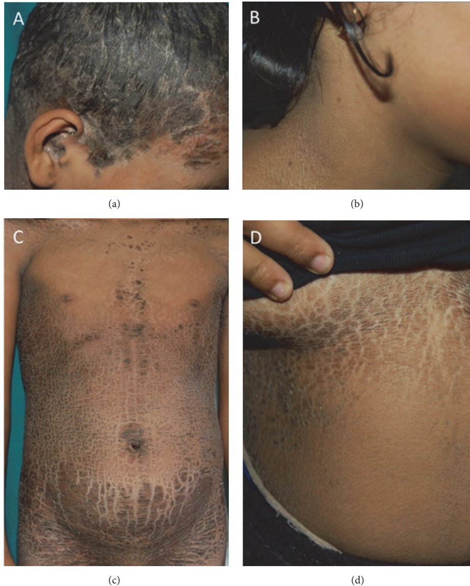
FIGURE 1: Clinical presentation of patient 1 and 2. (a, c). Patient 1 shows a lamellar type of ichthyosis involving the forehead, external auditory meatus, and neck, but sparing the centrafacial area by additional involvement of the bathing suit area. (b, d) Patient 2 shows a mild ichthyosis confined to bathing suit area with involvement of the axilla, but sparing of ears and face. The patient has been seen in winter.

perivascular infiltrates of lymphohistiocytes (Figure 2). The diagnosis of bathing suit ichthyosis (BSI) was made in both patients based on the criteria proposed by Jacyk et al. [3]. The patients were treated with bland ointments and mild keratolytics such as urea cream.