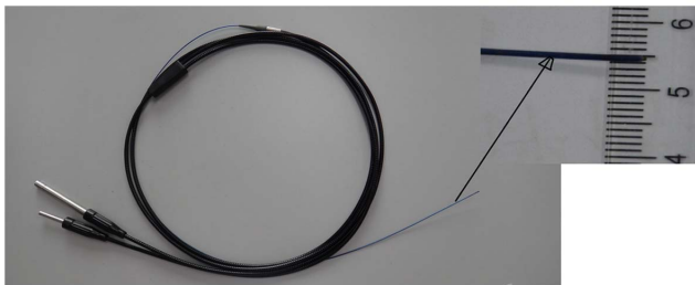
Figure 1. View of the entire micro-imaging fiber, showing the body of the fiberscope, objective lens, and connection to camera.

Immediately after induction of anesthesia, an endotracheal tube (Mallinckrodt Medical Co. Ltd., Co. Westmeath, Ireland, ID = 7.5 mm) was inserted to permit mechanical ventilation and to facilitate bronchoscopy. Respiratory rate (RR, breaths per minute), heart rate (HR, beats per minute), mean arterial pressure (MAP, mmHg), SpO 2 (%), and arterial blood gases (ABG) were recorded 5 minutes (min) before each operation, at 5 min intervals during the manipulation and at 5 min and 10 min after the manipulation. All arterial blood samples taken from the right femoral artery were immersed in ice and measured within 30 minutes on a blood gas auto-analyzer at 37°C.