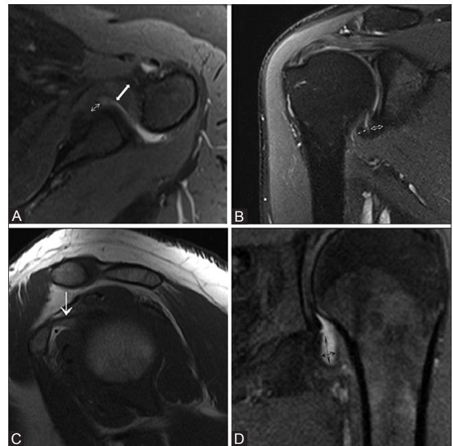
Figure 2(A-D): (A) Axial proton density (PD) fat-suppressed image shows the measurement of maximal thickness of the humeral (solid arrow) and glenoid portions (line arrow) of the anterior band of inferior glenohumeral ligament (IGHL). (B) Coronal PD fat-suppressed image shows the measurement of maximal thickness of the humeral (solid arrow) and glenoid portions (open arrow) of the IGHL at the midaxillary pouch at the level of glenohumeral joint. (C) Sagittal T1-weighted image shows the coracohumeral ligament (arrow). Normal fat in subcoracoid triangle (asterisk). (D) Coronal PD fat-suppressed image shows the measurement of maximal height and width of the axillary pouch