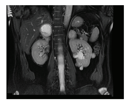
FIGURE 2: T2-weighted MR image in the coronal plane demonstrating bilateral, adrenal masses and renal cysts. The large adrenal mass on the right side has almost completely replaced the adrenal tissue.

were within normal limits. Ultrasound (US) and abdominal magnetic resonance imaging (MRI) were performed to understand the nature of a recent, blunt, nonspecific upper abdominal pain and revealed 3 small, solid masses in the right kidney measuring between 1 and 4 cm and 5 masses in the left kidney measuring between 1 and 3 cm in size. All were suggestive of renal cell carcinomas (RCCs) (Figure 1). An 8 cm solid mass completely replaced the right adrenal gland, while there were 5 small masses on the left side, all consistent with pheochromocytomas (Figure 2). The paracaval mass, measuring 4 cm in size, could be not only an enlarged lymph node but also a paraganglioma. The imaging findings of the cystic mass at the uncinate process of pancreas were suggestive of a neuroendocrine tumor (Figure 3). All other radiologic studies, including spinal and cerebral MRI, were normal. Serum and urine biochemical workup (including cortisol and vanilmandelic acid measurements) revealed normal findings regarding the functional status of the adrenal masses.