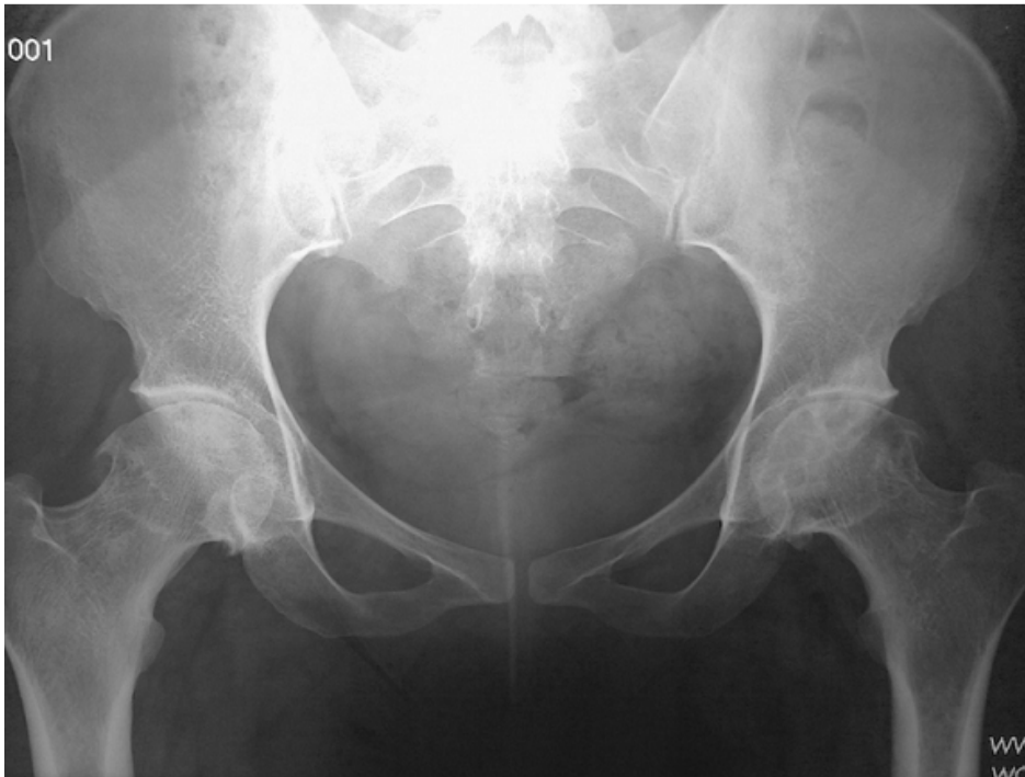
Figure 3: Prominent osteoarthritis, which is bilateral, with collapse of the articular surface and minimal loss of sphericity at the left femoral head