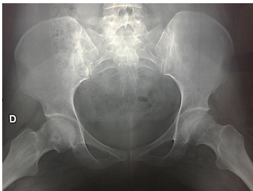
Figure 1: Left femoral heads subtle loss of sphericity