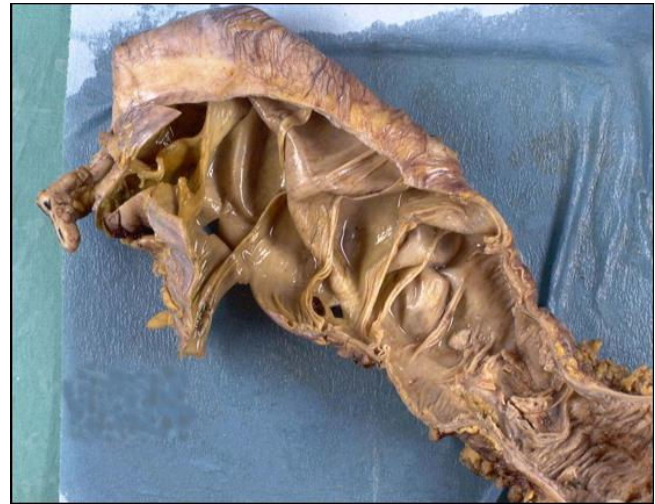
Figure 1 Macroscopic view of a resection specimen demonstrating numerous colonic diaphragms.

Microscopic examination of the specimen showed numerous elongated plicae (diaphragms) with submucosal