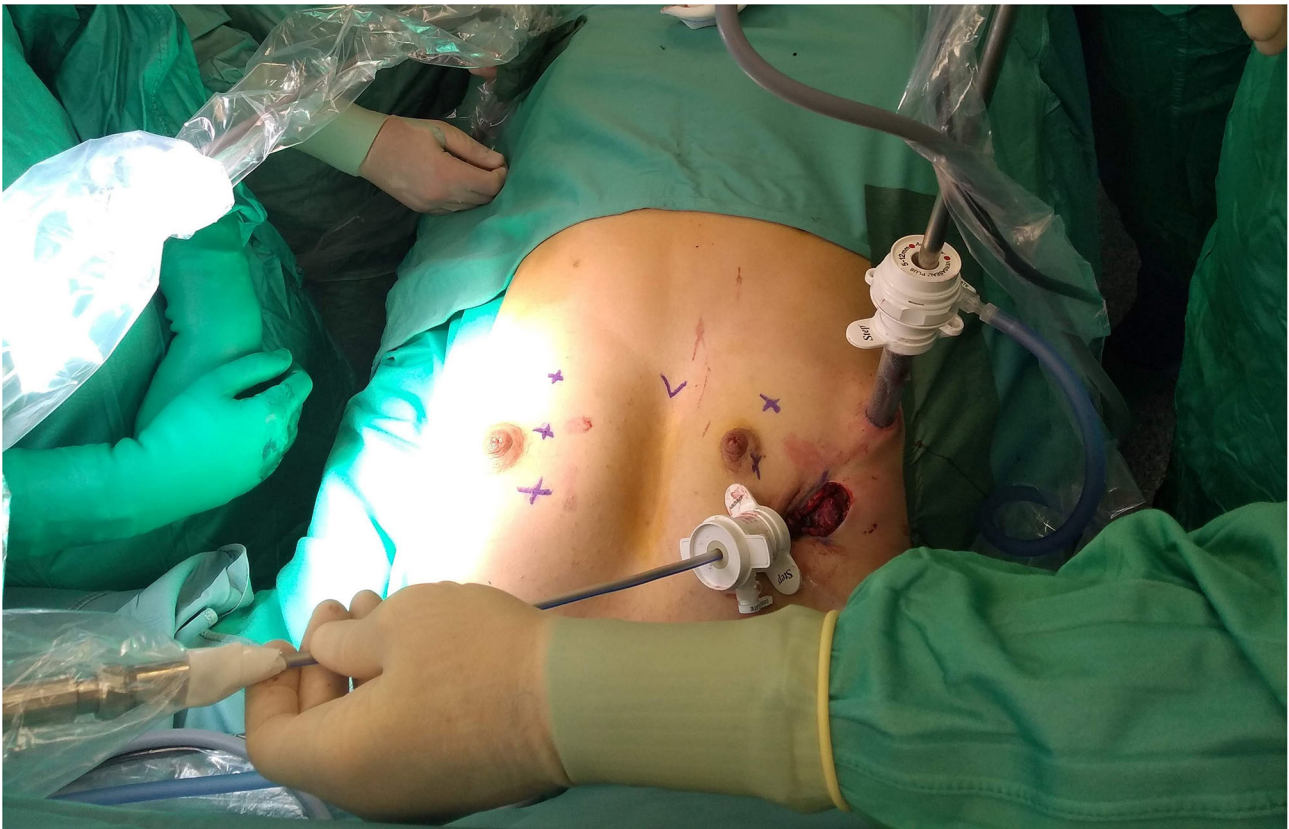
FIGURE 3 | Probe insertion through a 5 mm. Trocar placed at the site of surgical incision.