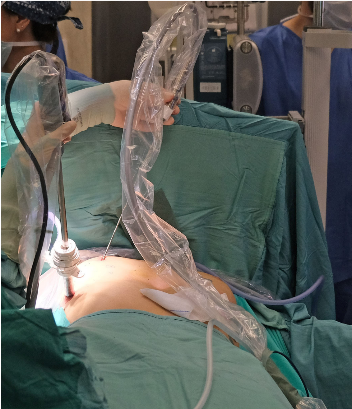
FIGURE 4 | Trocarless percutaneous probe insertion in a medial position.

to the posterior aspect of the ribs and the intercostal nerves (Figure 4).