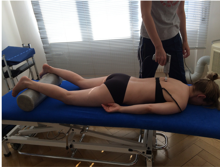
Fig. 5 Patient position during mechanical manipulation. The patient lies prone, arms next to the body in a relaxed position