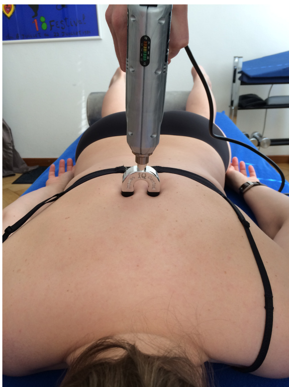
Fig. 6 Positioning of the double stylus. The double stylus is positioned directly on the treatment segment

The EQ-5D-5 L is a valid and reliable self-report questionnaire that measures patient's health status for clinical and economic appraisal using a descriptive system and a VAS [44, 45]. The descriptive system assesses mobility, self-care, usual activities, pain, discomfort and anxiety/depression and patients choose the most appropriate option from 'no problem' to 'extreme problem'. The digits for the five dimensions can be combined in a five-digit