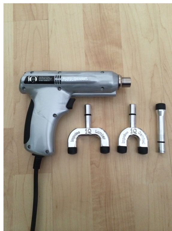
Fig. 1 Impulse IQ®. Picture of the device that was used to conduct the mechanical manipulations

The aim of this study is to compare the short and long-term treatment outcomes for neck pain patients using an instrument-assisted mechanical manipulation