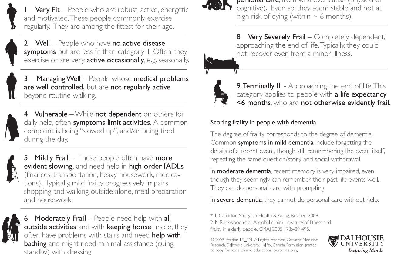
Figure 1. 'Rockwood' Clinical Frailty Scale (available on SWASFT electronic Patient Clinical Record).

Source: Canadian Study of Health and Aging (2008); Rockwood et al. (2005). © 2007–2009. Version 1.2. All rights reserved. Geriatric Medicine Research, Dalhousie University, Halifax, Canada. Permission granted to copy for research and educational purposes only.