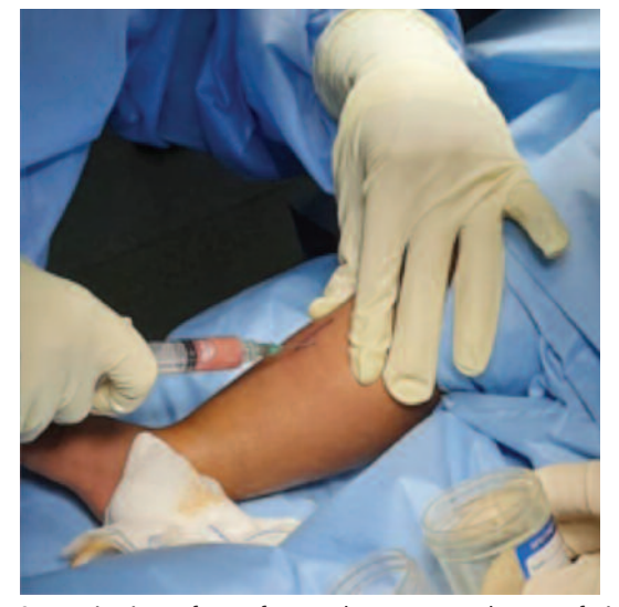
Fig. 3: Aspiration of pus from subcutaneous abscess of right proximal tibia region.