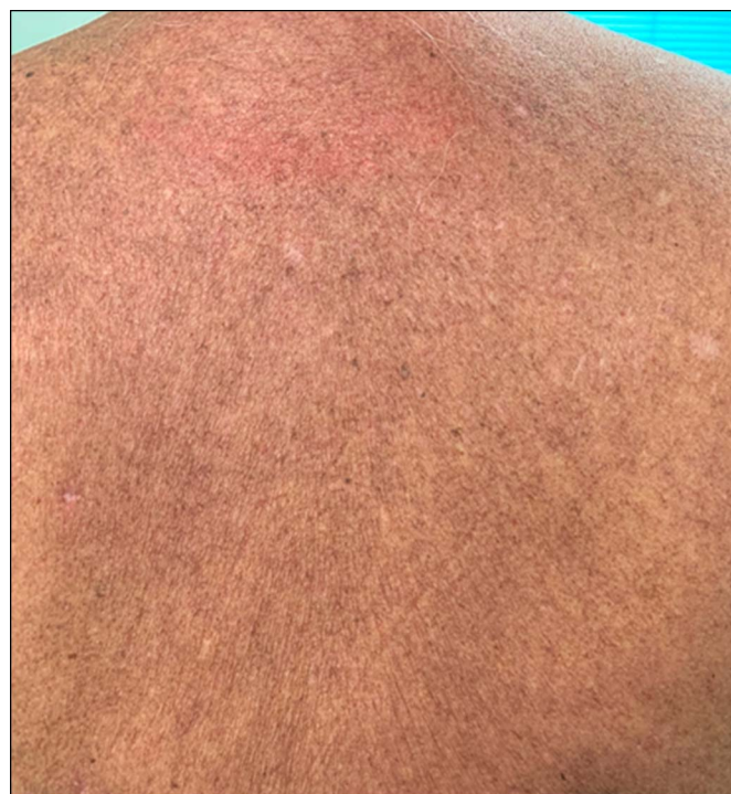
Figure 2. Resolution of skin rash after initiation of basiliximab.

There remain more questions than answers regarding treatment recommendations. This is predominantly because of a lack of prospective studies with large enough samples. Various treatment regimens have yielded poor outcome with mortality rates as high as over 70%. High-dose intravenous steroids and an increase in calcineurin inhibitor dose have been associated with high mortality, whereas agents such as interleukin-2 antagonists have shown promise, albeit small number. Furthermore, tumor necrosis factor- \alpha inhibitors and rituximab have also been trialed with improved outcomes. 1 Despite seemingly better survival with newer agents, mortality is still substantial