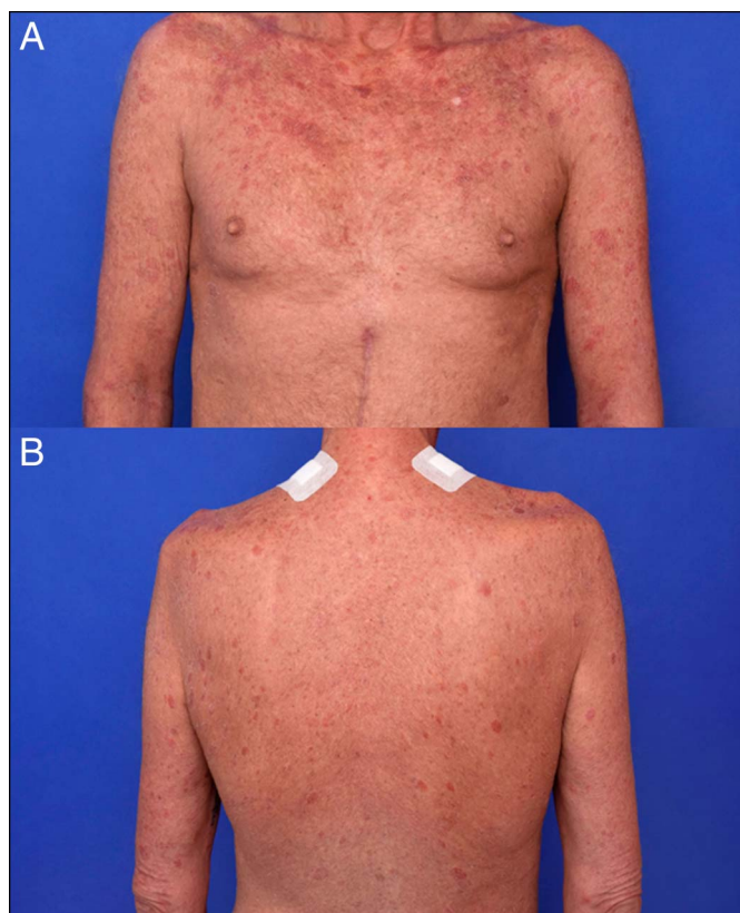
Figure 1. Skin rash involving the trunk with relative sparing of the extremities.

were performed by DNA profile analysis to calculate peak height percentages and the contribution of donor and recipient alleles. This demonstrated the presence of donor T lymphocyte macrochimerism at 63% (normally <1%), ultimately confirming the diagnosis of GVHD associated with liver transplant.