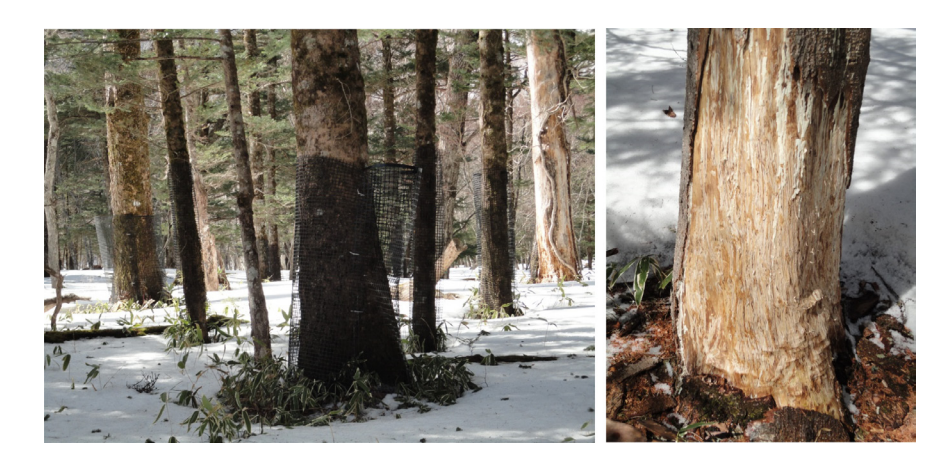
Fig. 1. Trunk of a fir tree fitted with a guard net to prevent debarking by deer (left) and a damaged trunk (right). In the winter, sika deer strip off the tree bark and eat the nutritious tissue beneath it. Unless wrapped, the trunks of fir trees are often damaged. Damage to half the circumference or more will kill the tree.

necessary to reduce the population further and control the density of deer to curb the detrimental effects on the forest ecosystem. At present, lethal methods (hunting and culling) are the only measure available in Japan. The Ministry of the Environment and the Ministry of Agriculture, Forestry and Fisheries have decided to halve the deer population in the current decade through accelerated culling. The policy is outlined in guidelines published in 2015 to establish a system that can work to achieve this objective (https://www.env.go.jp/ nature/choju/effort/effort9/kyouka.pdf, in Japanese). Many Japanese local governments have adopted their own management plans based on assessment of impact, recording the numbers of deer captured in the past and monitoring and estimating their current activity. Capture technology has been improved through introduction of various types of trap, effective baiting methods and sensor technology. On the other hand, most of the hunters currently operating are now 60 years of age or older. The decrease in the number of gun license holders is a serious obstacle to halving the deer population and maintaining the decreased level thereafter, as the high fecundity of deer means that the population recovers in a few years in the absence of culling or control pressure.