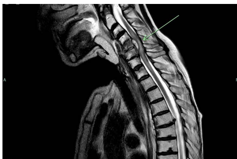
Figure 1. Sagittal T2 image showing spondylodiscitis C4-C5-C6, vertebral compression fracture and epidural abscess (arrow), compressing the spinal cord. Also posttherapeutic changes following laryngopharyngectomy, flap reconstruction and radiotherapy are seen.

A 68-year old woman was admitted to our hospital with severe bilateral shoulder pain, which had developed over the previous days, without a history of trauma. An underlying cardiac cause, for example myocardial infarction, had already been ruled out by a cardiologist. Upon admission the patient was stable with no fever present, but her laboratory results showed high inflammatory markers (i.e. C-reactive protein 321 mg/l). Computed tomography (CT) of head, chest and abdomen showed no local shoulder pathology or other clear focus of infection, therefore she was empirically treated with broad spectrum antibiotics. The following day she developed symptoms of shock (heart rate 67/min,