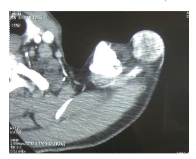
Figure 1. Angioscan: subcutaneous hypervascular and well circumscribed mass of the shoulder, without osseous involvement (arrow).

A 49-year-old man presented with a six-month history of a dermal and subcutaneous tumor of the left shoulder, without osseous involvement. Physical examination suggested a vascular tumor. An angioscan found a subcutaneous hypervascular and well circumscribed mass of the shoulder, without