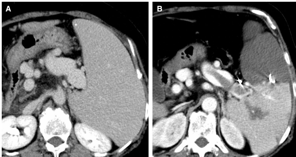
Fig. 2 A 60-year-old woman underwent PSE for thrombocytopenia. A Abdominal CECT before PSE shows no thrombus in the splenic vein. B Abdominal CECT after PSE shows a large thrombus in the

splenic vein. Infarcted splenic volume after PSE in this patient was 707.1 mL, and percentage of infarcted spleen was 60.1%