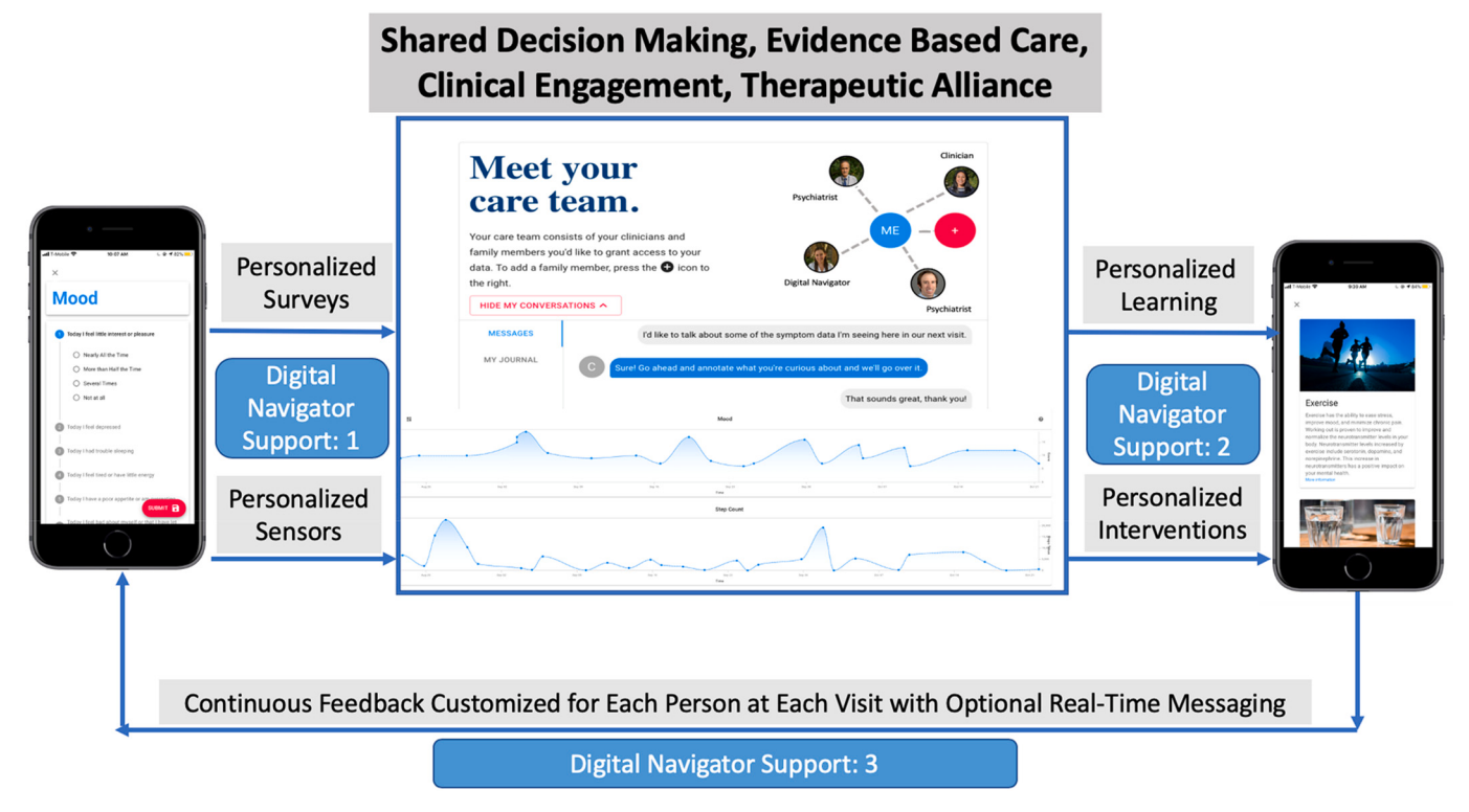
Fig. 2. The mindLAMP platform includes a visual representation of the patient's care team. The role of technology in capturing data as well as offering learning and interventions is also highlighted, as are at least three areas where a digital navigator is able to offer assistance.

provide inclusive and responsive team-based care. Clear parameters and guidelines around communication with patients outside digital clinic visits are considered here as well. Policies and informed consent to ensure use and response to any messages sent through the messaging feature on mindLAMP are well outlined and emergency plans are put in place. Some clinics may be able to monitor messaging 24/7 and while others may not. Use of backend analytical software to identify changes in app data that may warrant a response are also considered during preimplementation. Actions plans that respond to an event of unusual patient data are established to ensure safety.