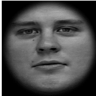
Figure 1. Example of a frame of a human face without distracting elements (adapted from Fantasmorph). ©Jeffrey Cohn, S52.

These videoclips were split into two conditions to compare emotion recognition in human and cartoon faces. These two conditions were chosen on the basis of studies carried out by Jusyte in 2017 [8] and Brosnan et al. in 2015 [49], which analyzed emotion recognition through human animated stimuli (in the first case) and through human and digital animated stimuli (in the second). Our task included a training session and two different conditions (Figures 1 and 2) [56,57].