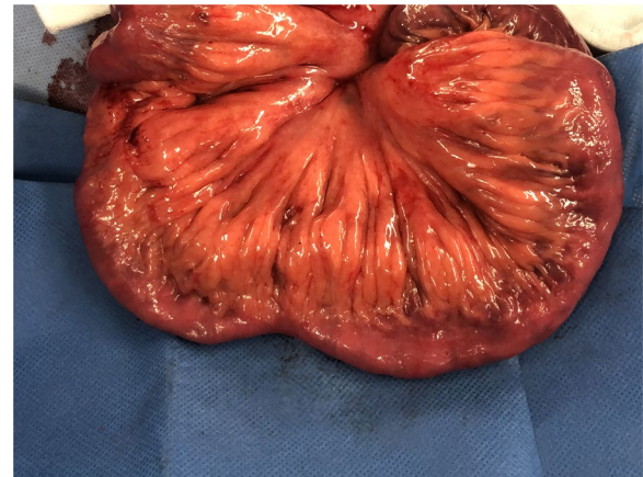
Fig. 1 Small bowel lesions not targeted for resection. Representative case. The preoperative examination showed no obstruction, while intraoperative findings revealed CD lesions with creeping fat. Such cases were defined as having residual disease

CD was confirmed by a histological examination of the resected specimen. Surgical recurrence was defined as the necessity of a reoperation because of recurrent CD during the observation period. The causative lesion responsible for the reoperation was confirmed by endoscopy, contrast examination, and CT findings. Lesions considered responsible were classified as anastomotic, non-anastomotic, or both. When the preoperative examination results showed no obstruction but intraoperative