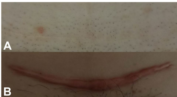
Fig. 2 Photographic appearance of Cesarean section laparotomy scar showing a perfect healing with MSS 4 and b severe scarring with MSS 13