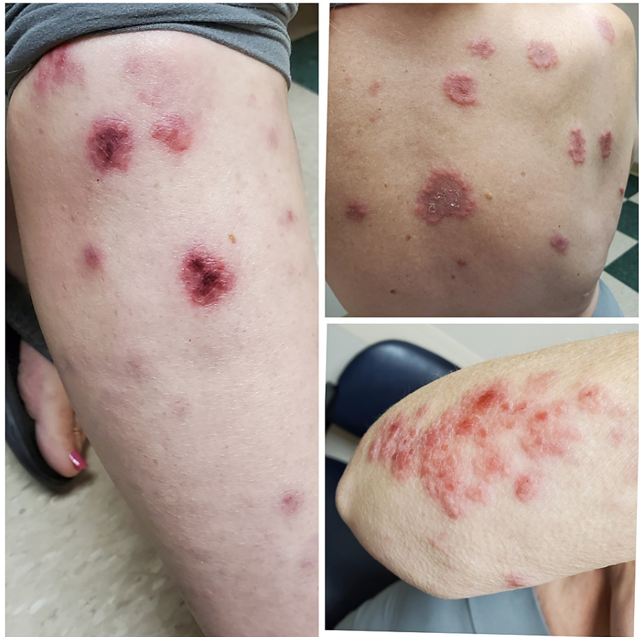
FIGURE 1: Erythematous, blanchable, palpable, annular papules and plaques on the back, right shin, and right arm

Skin examination revealed edematous, blanchable, palpable, red annular papules and plaques on the back and extremities, with the greatest amount present on the lower extremities (Figure 1). The lesions on the back had centripetal scaling. A resolving flesh-colored annular papule was present on the face. No active lesions were found in the mouth. There was 2+ pitting edema in the lower legs.