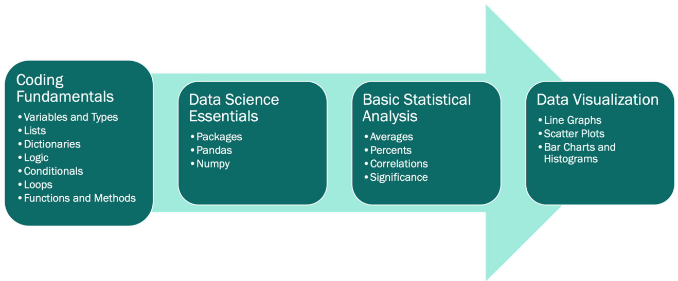
Figure 1: Our lesson modules.

All Jupyter notebooks are available on GitHub ( https://github.com/GWC-DCMB/curriculum-notebooks ).