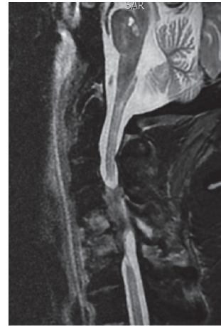
FIGURE 1: Septic involvement of cervical spine and spinal cord.

Despite his rehab program, the patient did not report any neurological improvements; at a 5-week follow-up, a new encephalic and cervical MRI showed worse conditions: septic