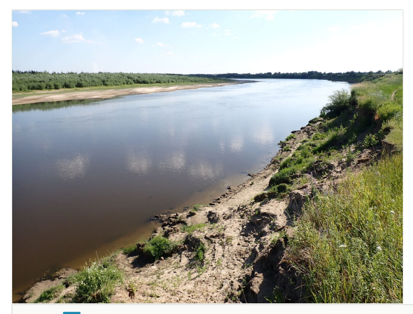
Figure 5. doi Tura River flowing in the West Siberian Plain (Tyumen Region, Russia).