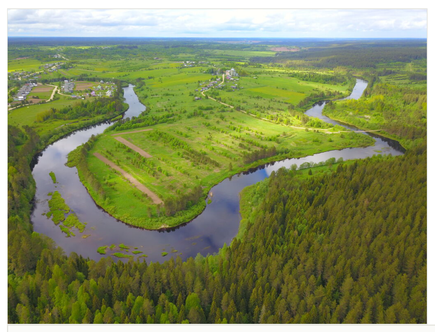
Figure 3. doi Vaga River flowing in upland (Vologda Region, Russia).