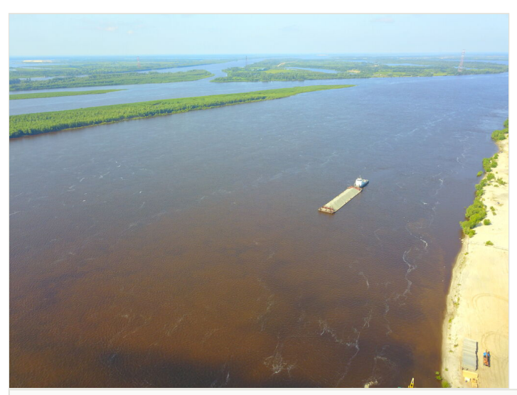
Figure 6. doi Ob River in Surgut City (Khanty-Mansi Autonomous Okrug, Russia).

Coordinates: 51.814 and 64.573 Latitude; 33.283 and 76.426 Longitude.