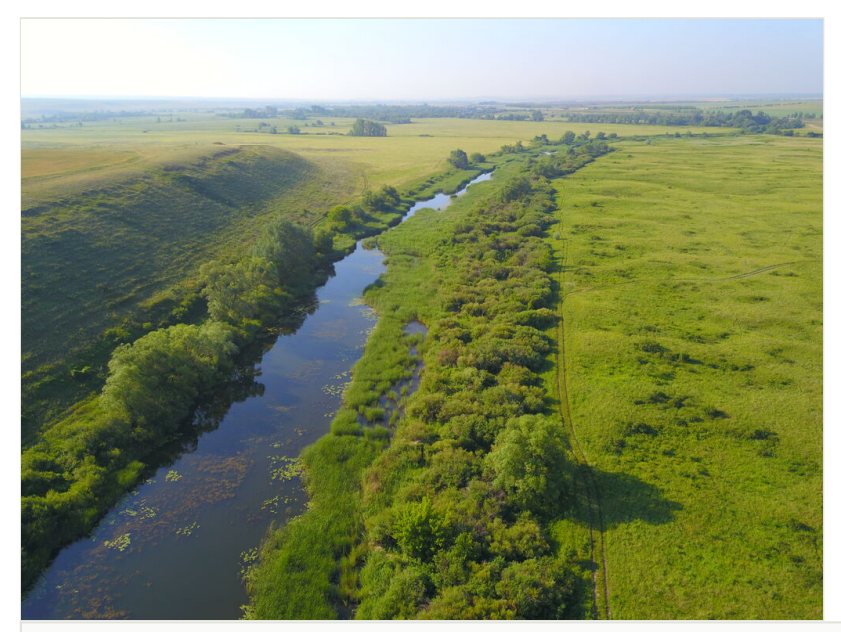
Figure 4. doi Salmysh River flowing in the forest-steppe (Orenburg Region, Russia). Photo by Dmitriy A. Philippov (2021).