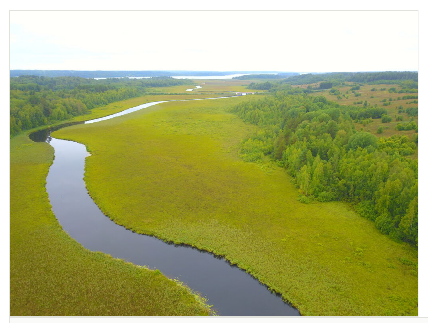
Figure 2. doi lleksa River passing through the eutrophic mire (Vologda Region, Russia).