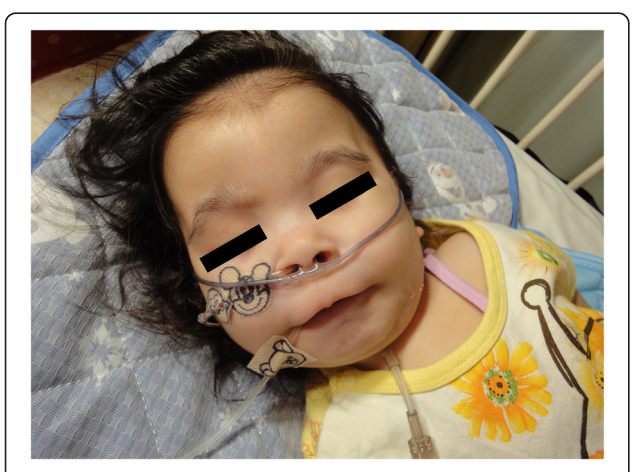
Fig. 2 Facial photograph of the patient. The typical facial features of Miller–Dieker syndrome (MDS) are seen. These features include prominent forehead, bitemporal hollowing, short nose with upturned nares, prominent upper lip, and micrognathia

surgery. No premedication was given. Equipment for difficult intubation was prepared, and two anesthesiologists were present in the operation room. On arrival at the theater, pulse oximetry, ECG, and noninvasive blood pressure monitoring were established. Bispectral Index (BIS) electrodes (BIS Pediatric Sensor; Covidien, Minneapolis, MN, USA) were placed on the patient's forehead and temples according to the manufacturer's recommendations. Although BIS monitoring is primarily an objective means of assessing the level of sedation in adults, it is reported that BIS monitor is reliable for measuring depth of sedation in children aged more than 1 year [3]. The BIS value is a number between 0 and 100, BIS values near 100 being considered "awake". Maintenance of a BIS value