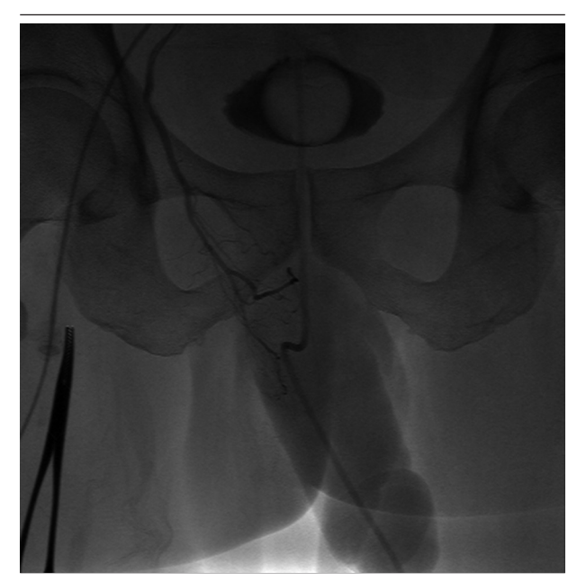
Figure 2. Abnormality of the Penile Circulation

The most frequent primary tumors come from the genitourinary (70%) and gastrointestinal tracts (23%). Among these, the bladder cancer (27%) and prostate cancer (26%) are the most common primary tumors, followed by the renal cell carcinoma (8-11%) and testicular germ cell neoplasm (3-10%), respectively (5, 8). How penile metastasis develops is still not quite clear. Direct extension, retrograde venous or lymphatic transport, arterial embolism, implantation and instrumentation are the five most possible mechanisms of tumor spread to the penis (9). It is vital for urologists to be alerted of priapism refractory in regular therapy such as pharmacologic therapies or shunts. Correct \, diagnosis \, of \, such \, an \, uncommon \, condition \, requires careful examinations. Penile ultrasonography is a useful method to detect the metastatic lesions and is helpful to differentiate high and low flow priapism. Cavernosa blood gases test can distinct between the two types of priapism. We recommend that chest-abdomen-pelvic CT scan be perform immediately because it is reliable for confirming the diagnosis and assessing of disease extension. MRI scan is also a useful alternative (10), but the best diagnosis is obtained through histopathological biopsy.