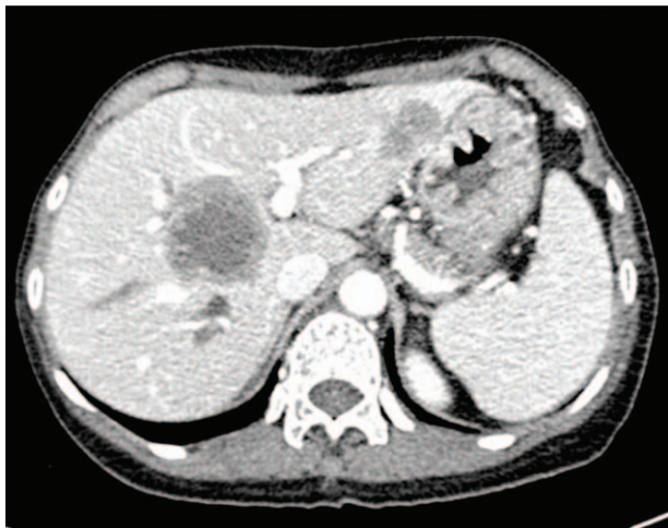
Figure 1. Preoperative computed tomography showing the tumor invading the segment VIII, segment IV, and segment III; the FLR is 376 mL. FLR = future liver remnant.

Hepatectomy may prolong the survival time of colorectal cancer patients with liver metastases. [3] However, for patients with bilateral liver metastases, a curative resection either cannot be achieved with a single procedure or would result in a too small FLR. [6] To address this problem, 2-stage liver resection with portal vein embolization (PVE) or portal vein ligation was