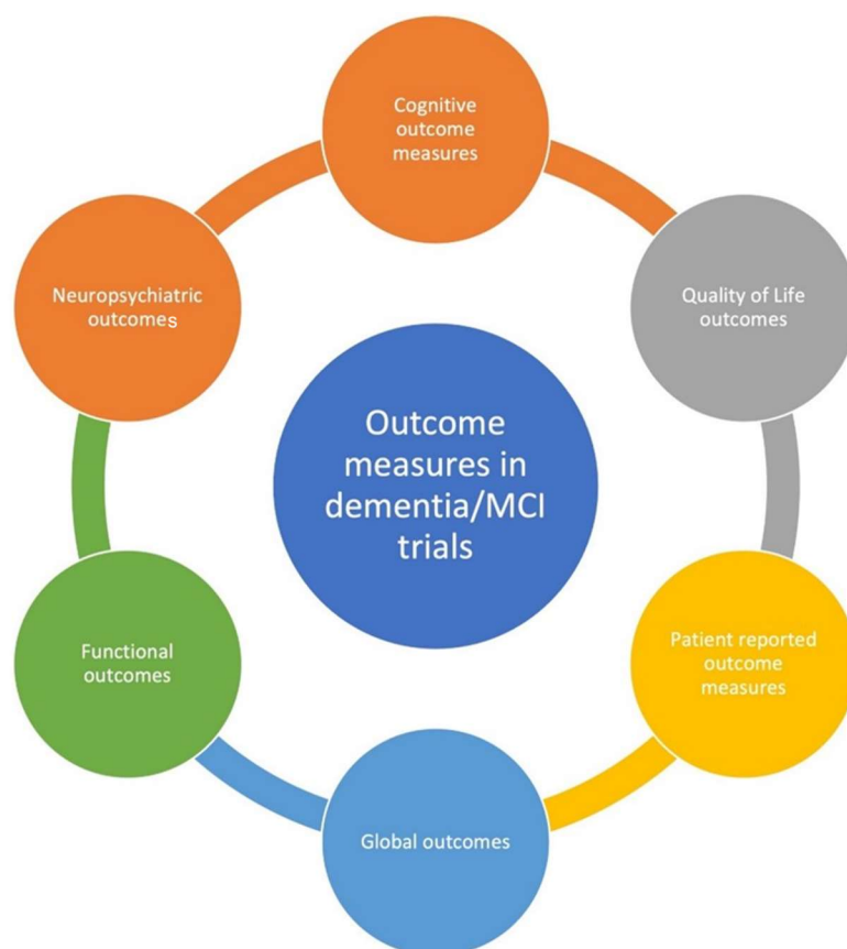
Figure 1. Types of outcome measures used in dementia and MCI clinical trials.