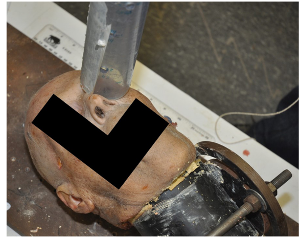
Fig. 1 Immobilization of the heads in cement filled PVC pipe fastened to an iron bracket

A similar protocol to that described by Kellman and Schmidt was used to recreate hydraulic mechanism of trauma to the orbit [2]. Each head was potted in a 4" PVC pipe filled with dental cement (Denstone Golden, Modern Materials, IN, USA), and mounted in an iron bracket for immobilization during testing (Fig. 1). Endoscopic uncinectomy, maxillary antrostomy, anterior and posterior ethmoidectomy was performed on one, randomized, side of each head by a fellowship-trained Rhinologist. A frontal sinusotomy was not performed. Uncinectomy was performed using a swing-door technique with a pediatric back-biter, and ethmoidectomy was performed with a J-curette and thru-cutting instrumentation to skeletonize the lamina. The un-dissected side was used as an intra-specimen control. Pre- and post-operative axial, coronal and sagittal reconstruction CT scans were performed on all fresh-frozen heads to confirm no orbital fractures or violation of the lamina was present prior to trauma testing. The same CT scanner was used to obtain all CT scans using 0.5 mm axial cuts reformatted to sagittal and coronal slices using the standard protocol for CT facial bones at our institution. 3D reconstructions were also performed. CTs were reviewed by a senior Otolaryngology resident and faculty