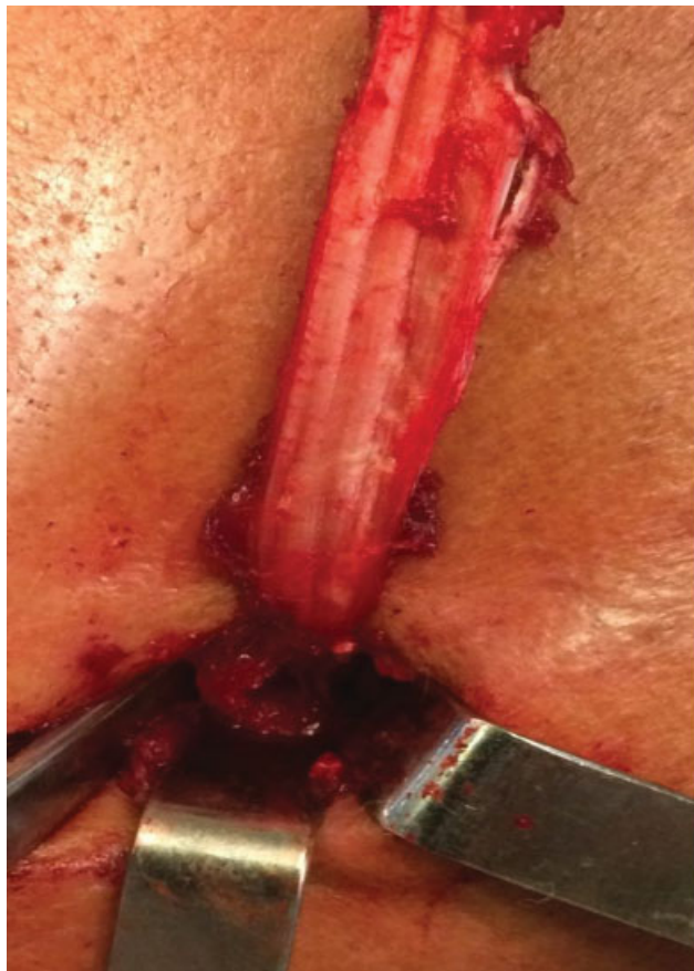
Fig. 3 The distal end of the graft attached to the biceps tuberosity.