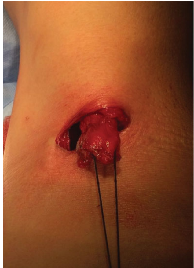
Fig. 1 Distal biceps tendon after release showing the impossibility of direct repair.

The surgeries were performed under general anesthesia associated with locoregional block of the brachial plexus in horizontal dorsal decubitus without the use of tourniquets. We opted for the two-incision technique described by Boyd and Anderson 11 and modified by Morrey et al., 7 and used a graft from the distal tendon of the triceps brachii. The criterion used to define the tendon reconstruction was the impossibility of excursion of the remnant tendon up to the radial tuberosity, even after release of the lacertus fibrosus. A transverse incision of ~ 3 cm is made in the anterior cubital fold. The biceps tendon is easily captured when the skin is pulled proximally and is removed from the deep tissues. The most distal portion of the degenerated tendon is resected and repaired with Bunnell stitches using #5 nonabsorbable sutures (► Fig. 1). Then, the radial tuberosity is palpated, and a curved Kelly caliper is passed through the biceps tendon tunnel between the ulna and the radius, advancing until its apex is palpated in the dorsal aspect of the proximal forearm. The second incision is made on the caliper. The tuberosity is exposed by means of muscular divulsion, with the forearm at maximum pronation. The radial