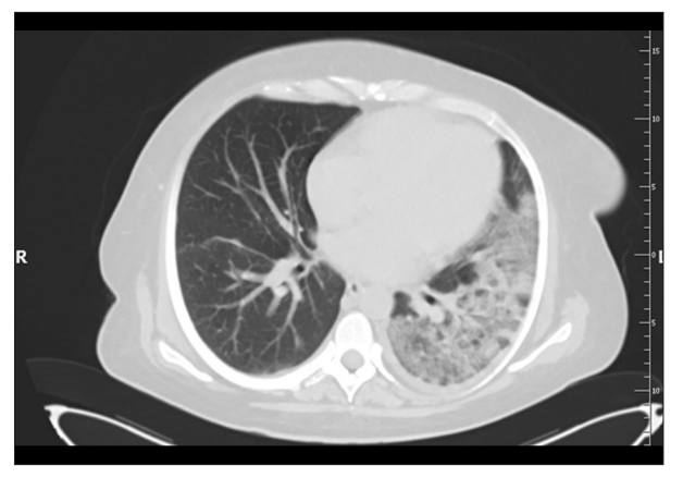
Figure 2. Case 2: Computed tomography (CT scan) of the chest without contrast (lung window). The left lung shows massive areas of the crazy-paving pattern resulting from the superimposition of a thickened interlingual partition on the ground-glass opacity lesions and discreet changes in the right lung.

An unenhanced CT scan of the thorax revealed bipulmonary ground-glass opacities and a crazy-paving appearance predominant on the left side, compatible with COVID-19 viral pneumonia (Figure 2). A CT scan of the abdomen showed splenomegaly and an enlarged, steatotic liver surrounded by ascitic fluid. Oxygen saturation decreases below 88% to 90% were noted and she received oxygen supplementation with an initial good result (pulse oximetry increased to 94%). An ICU practitioner assessed the patient's respiratory condition and her requirements for intensive care management; however, initially, she did not meet the ICU admission criteria. The patient gave written consent for treatment with lopinavir/ritonavir and tocilizumab. As treatment, she received chloroquine (500 mg twice daily, oral), azithromycin (500 mg once daily, oral), ceftriaxone (2 g once daily, intravenous), albumin infusions (20 g once daily, intravenous), diuretics (spironolactone 200 mg daily, intravenous; furosemide 80 mg per day, oral), vitamin K supplementation, hepatoprotective drugs (silibinin 140 mg 3 times daily, oral; ornithine aspartate 3 g twice a day, oral), and subsequently lopinavir/ritonavir (400 mg/100 mg twice daily, oral) and steroids.