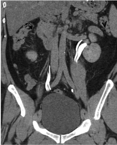
FIG. 1. CT urogram delayed phase showing right trifid and left bifid collecting systems.

a common intramural tunnel. Using a flexible ureteroscope and 200- \mu m laser fiber, laser lithotripsy was able to fragment the left lower pole stones to small 1–2 mm passable fragments and the patient was left with a stent. The right upper pole moiety was stented with a 6F \times 24 cm Double-J stent to help dilate the ureter and provide access for percutaneous nephrolithotomy (PCNL).