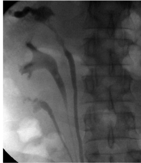
FIG. 3. Retrograde pyelogram showing trifid right-sided collecting system (Type I).

sation and the Malecot re-entry tube was removed. At the termination of our third procedure, the patient was left without any nephrostomy tubes or ureteral stents and was cleared of all stone burden. Postoperative follow-up 1 week after the final procedure revealed that the patient was comfortable, in no distress and without pain, had no evidence of fevers or infection, and was voiding comfortably. Stone analysis revealed a composition of 100% calcium oxalate monohydrate.