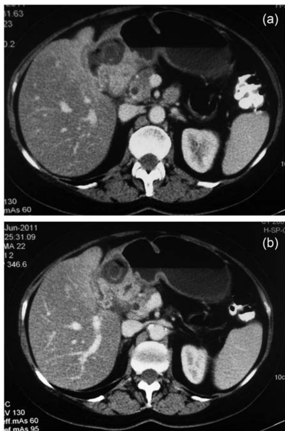
Figure 1: (a and b) CT of the abdomen.

gallbladder indenting on the gastric antrum with a fistula present between the two. There was also extensive thickening of the gallbladder wall. Air was seen to pass from the stomach around the gallstones in the gallbladder. The patient then proceeded to upper gastrointestinal tract endoscopy as shown in Fig. 2a and b.